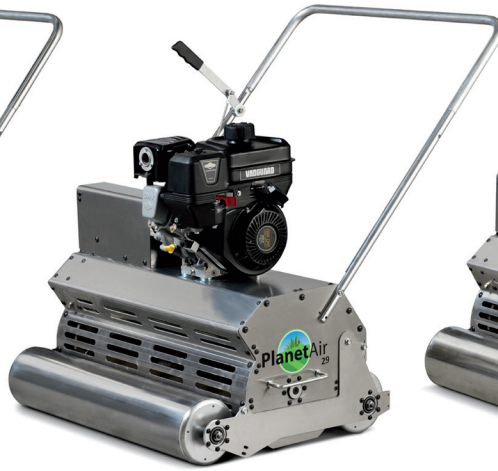
PlanetAir 29 with Trailer