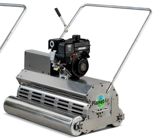
PlanetAir 37 with Trailer