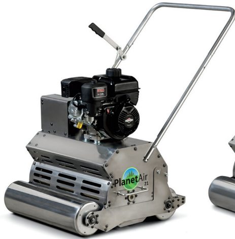
PlanetAir 21 with Trailer